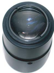
AVI Coolpix adjustable Optical Link For all "C" mounts adapters.